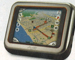
Mio DigiWalker C220

The finest gadgetry is useless if it runs out of power. Fortunately, the sun can be your outlet. With a solar-charging device such as the Voltaic Backpack ($250 street) or the Brando Universal Solar Charger ($70 direct), you'll have the juice you need in a pinch.—Aaron Dalton